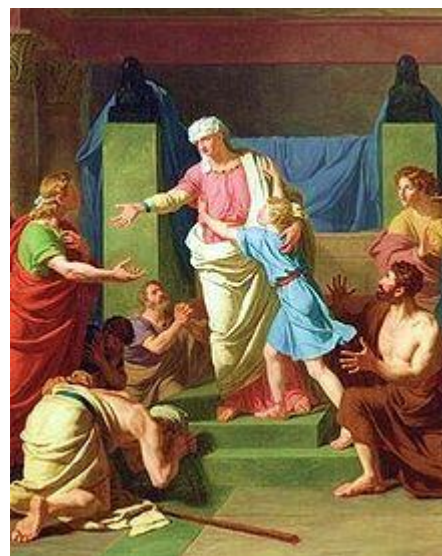
Joseph identified by his brothers (1789 painting by Charles Thévenin )

"Then Joseph could not restrain himself before all those who stood by him, and he cried out, "Make everyone go out from me!" So no one stood with him while Joseph made himself known to his brothers. And he wept aloud, and the Egyptians and the house of Pharaoh heard it ." (Genesis 45:1-2)