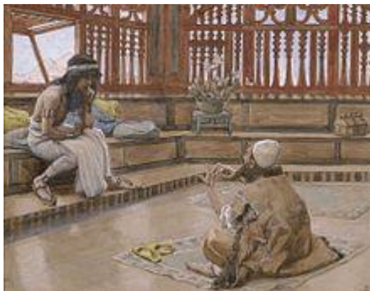
Joseph Converses with Judah, His Brother (watercolor circa 1896–1902 by James Tissot,)

Judah offered to give his life as a ransom so that Benjamin would go free. Because a silver cup was found in Benjamin’s bag, (having been planted there deliberately by Joseph), Benjamin was in danger of having to remain a slave in Egypt while the other brothers returned to Egypt.