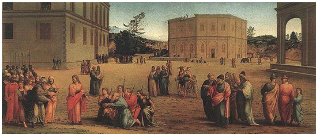
Joseph Presents His Father and Brothers to the Pharaoh (1515 painting by Francesco Granacci )

“Trust in the LORD with all your heart, and lean not on your own understanding; In all your ways acknowledge Him, and He shall direct your paths.” (Proverbs 3:5-6)