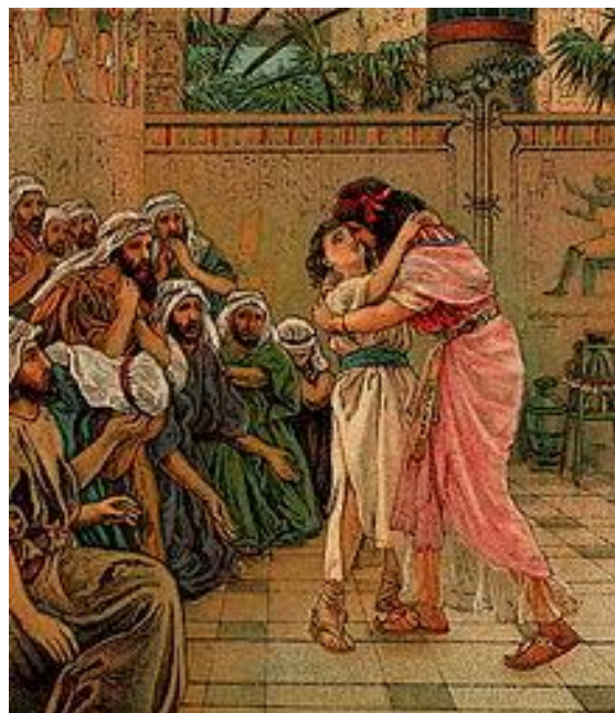
Joseph Forgives His Brothers (illustration from a Bible card published 1907 by the Providence Lithograph Company)

No, no, absolutely not! Joseph’s first concern was to alleviate his brothers’ tormenting guilt and remorse over their crimes against him.